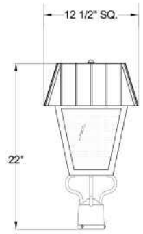
STL/12CF Horizontal: 69W Vertical: 54W

4. Distribution: Matrix #: Description: H2 Type 2 - Horizontal H3 Type 3 - Horizontal H4 Type 4 - Horizontal H5 Type 5 - Horizontal Horizontal V3* Type 3 - Vertical V5* Type 5 - Vertical Vertical