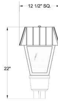
STL/12BH Horizontal: 69W Vertical: 54W